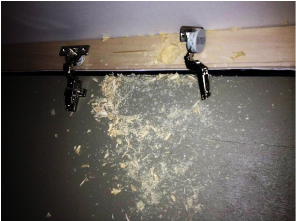
Step 1 – Mount Brackets to Frame