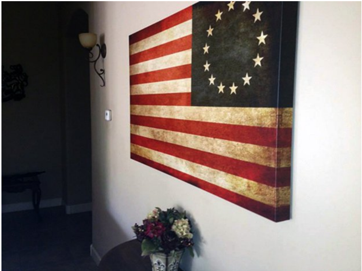
AR15 Currently behind picture. Mounted flush against the wall, only 2.5" thick.

Proper storage techniques can help to ensure the safety of your loved ones. Here is a nifty way to store your rifle or a larger gun without anyone thinking twice about it.