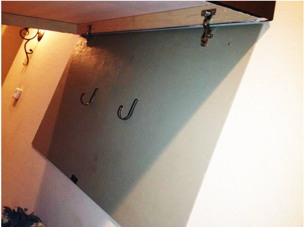
Step 2 – Mount and Install L Brackets