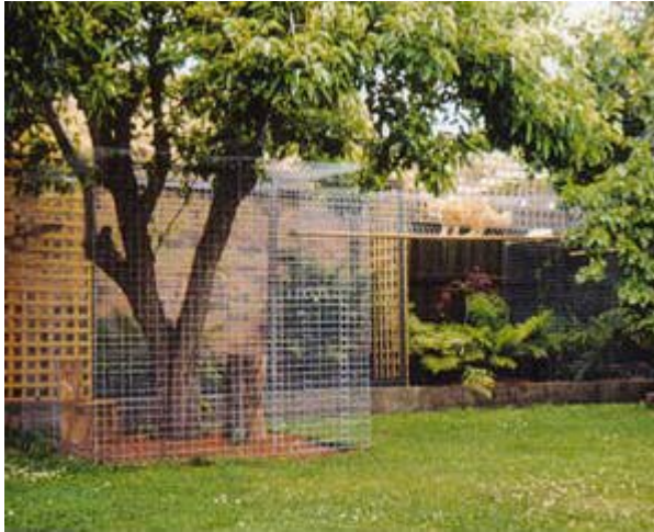
Park around Tree Shadehouse around a tree linked via an Aerial cat tunnel to the house.

An effective yet affordable method to securely enclose selected or complete areas of your property. Ask us about DIY systems