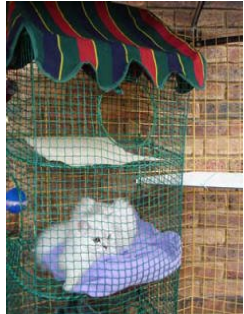
All our cats are indoor cats with full access to our first floor balcony (which runs the length of our house) and a enclosure (we call it out "cat sun room") connected to the balcony located in our small garden. We built our enclosure extension at the end of 2005. The main enclosure extension is hexagonal shaped with a built in staircase connecting the enclosure to our first floor balcony. We have also installed blinds and vinyl water proofing to shelter our precious babies from the harsh weather. It is literally a dream house for any cat. I've been told by my friends that it is 6 star cat sun room. OUR CATS DO NOT SLEEP IN THE ENCLOSURE. THEY SLEEP ON OUR BED :)