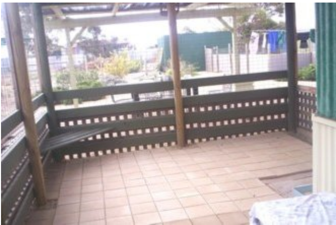
Photos of Christina's Enclosed verandah. A very effective Cat Enclosure