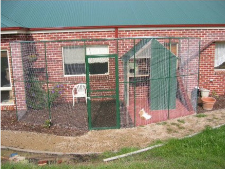
The cats access the cat run via a cat flap in the laundry wall. The cost of materials for this cat run set me back about $1200 And the labor to build it was about 40 Hours.