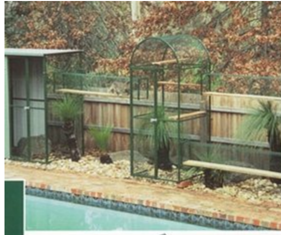
Complete with outdoor cat tunnels and a shelf for bedding. Wire cat tunnels can go from your house to the cat enclosure