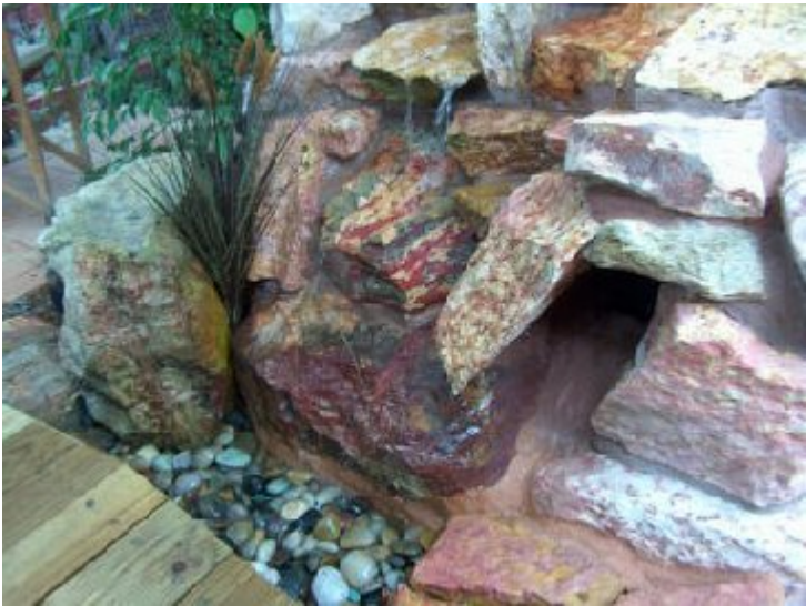
The Cat Tunnel