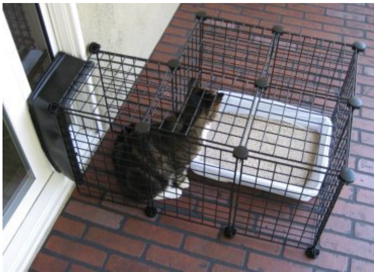
Move your cat's litter box (and the associated odors) outdoors! The Model L-30 Litter-Box Outhouse™ is a small outdoor enclosure with enough room for a litter box. Your cat can relieve itself outside any time it needs to do so, and yet your cat will be safely confined to a steel cage with a rust-proof plastic coating. An adapter that connects the cage to a pet flap-door is included