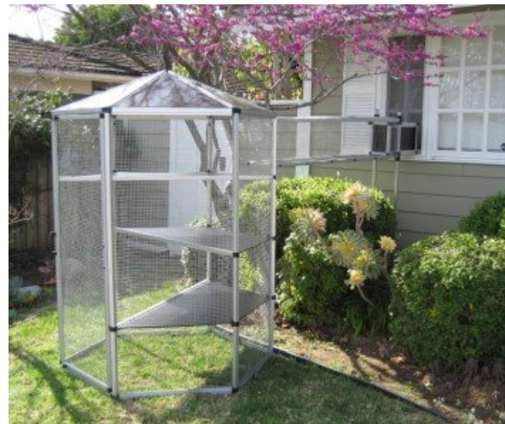
This attractively styled, hexagon-shaped Outdoor Cat Enclosure features 3 platforms, arranged in a spiral staircase configuration, so your cat can climb to various heights. The enclosure also features a bronze-tinted translucent roof to provide shade from the sun and cover from rain. There is a full-size latching door so that you can add or remove play toys, change a litter box, or clean the interior platforms.