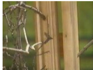
Finished screen - cove and branches detail