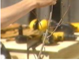
New growth is straight and flexible