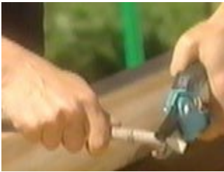
Cut the ends square

Trim all the leaves from the branches you've chosen, exposing the shape of the branch. New growth tends to be straight and more flexible. Old growth tends to have more bends and knuckles and it will be more rigid.