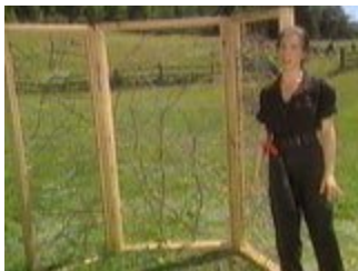
Finished screen - three panels

Make the hinges so they look like a door hinge. Cut out three-inch squares of leather. Then punch holes with a leather punch where the screws go. (If you don't have a leather punch, an awl will work too. Pre-drill and screw the hinges in place using brass or other exterior grade pan head screws. Use small washers under the screw heads if the leather wants to pull away from the screw.