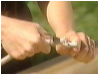
Peel the bark off the end with a knife