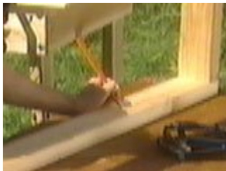
Mark the centre of the frame along the inside