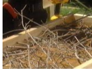
When finished, the branches will be very wild and rowdy

If some of your branches are really long, you'll need to peel bark from the tips and glue them into holes drilled in the opposite side of the frame. Gluing branches from side to side or even end to end helps stabilize the branches and the frame.