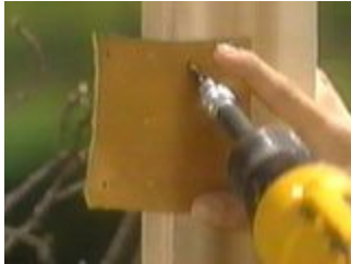
Pre drill for screws