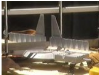
Cut it at a 45-degree angle at the mark