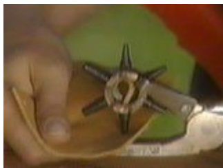
Use a leather punch to make