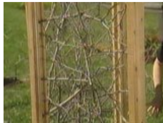
Finished screen - detail