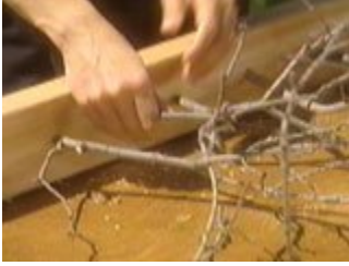
Continue along, filling in the space with branches