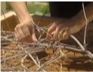
Weave them together to flatten and strengthen the structure

If some of your branches are really long, you'll need to peel bark from the tips and glue them into holes drilled in the opposite side of the frame. Gluing branches from side to side or even end to end helps stabilize the branches and the frame.