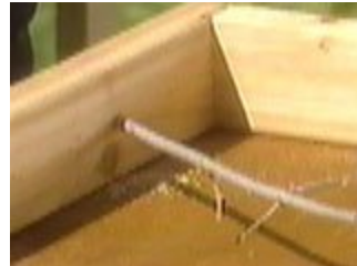
Fit the branch to be sure it's snug