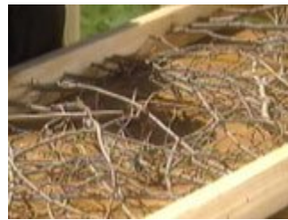
When finished, the woven mat will be quite springy

After all the braches are glued in place, weave together the twigs that stick out coaxing them into the flatter plane of the frame. If your branches are green enough, they should bend easily around the others, making a springy mat.