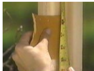
Set hinges about 11 inches