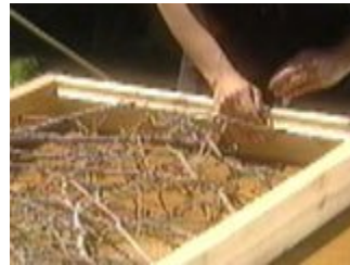
Glue the piece in place

Trim the inside of the frame with cove molding, mitering the corners. When all trim pieces for one side of the frame are cut to fit, glue and clamp them to the frame. Flip the panel over and repeat on the other side.