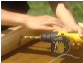
Start the drill straight to drill an angled hole

TIP: Use your drill index to help determine the size of the hole to drill. Pull out a drill that appears to be the correct size and try putting the branch end into the hole. Keep trying until you find a hole that fits the branch very snugly. Use the bit from that hole to drill into the frame.