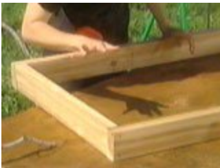
Screw the corners of the frame together

Prep the ends of the branches by cutting them off cleanly with your pruning shears. No smooshed ends. Remove one inch of bark from the end of the branch using a knife. Take a look at the end of the branch and if it's not quite circular, whittle it into a circular shape since you want it to fit nicely into a drilled hole. Be careful not to taper the end. It needs to be cylindrical, not conical like a sharpened pencil.