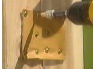
Attach the hinge with 'pan head' screws