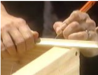
Hold the cove moulding in place and mark the length

After all the braches are glued in place, weave together the twigs that stick out coaxing them into the flatter plane of the frame. If your branches are green enough, they should bend easily around the others, making a springy mat.