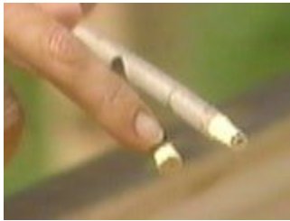
A cylindrical end will make a much better joint than a conical one

Prep the ends of the branches by cutting them off cleanly with your pruning shears. No smooshed ends. Remove one inch of bark from the end of the branch using a knife. Take a look at the end of the branch and if it's not quite circular, whittle it into a circular shape since you want it to fit nicely into a drilled hole. Be careful not to taper the end. It needs to be cylindrical, not conical like a sharpened pencil.