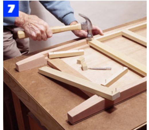
After assembling the case ends, glue and nail the drawer guides in place. Spacers ensure accurate positioning.

We built the drawers with a drawer lock joint as shown in Detail 4 of the drawing on page 89. After cutting the pieces to exact size, use the tenoning jig to cut the grooves in the ends of the drawer fronts. Use the miter gauge and repeated cuts to