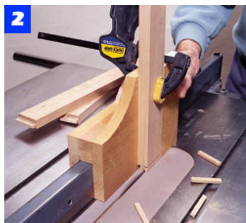
Make the tenon cheek cuts with a tenoning jig. This shopmade version slides along the table saw fence.