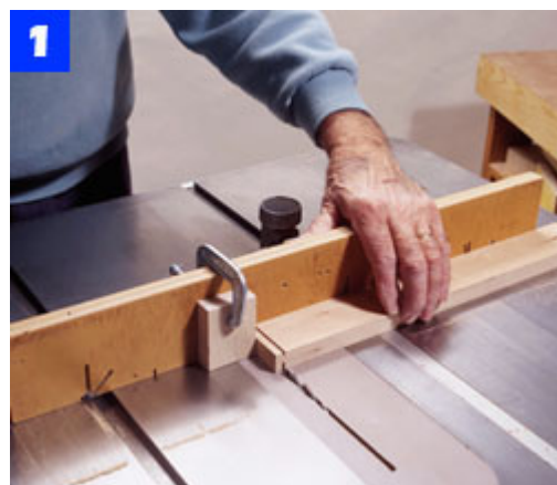
Use a stopblock clamped to an auxiliary miter gauge fence to accurately position the tenon shoulder cuts.

Temporarily clamp the rails and leg assemblies. Hold the parts in alignment with two 3/4-in. brads at each joint, using pilot holes to prevent splitting the wood. Then, rout the decorative bead around the inside edge of the frame (Photo 6). Finally, cut