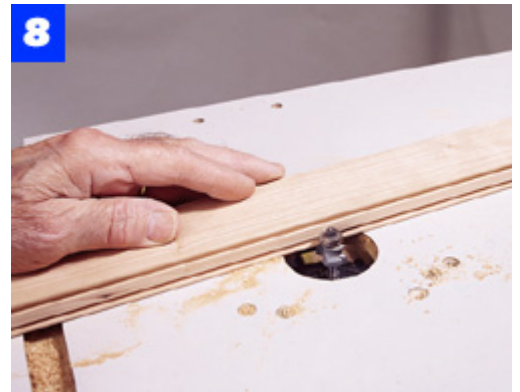
Set the height of the beading bit to cut one-half bead. Then, rout upper and lower edge of each front divider piece.