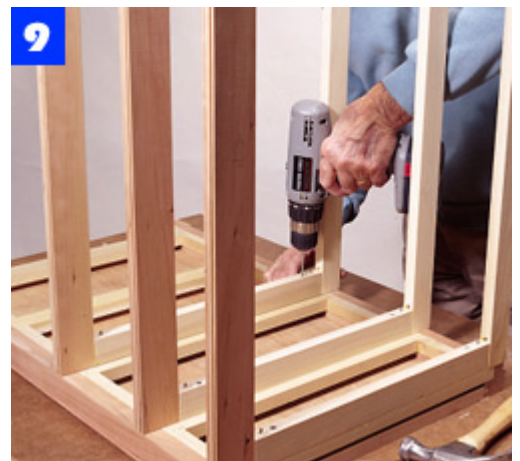
Use partially driven nails to hold drawer frames when drilling screwholes. Dry assemble and check before gluing.