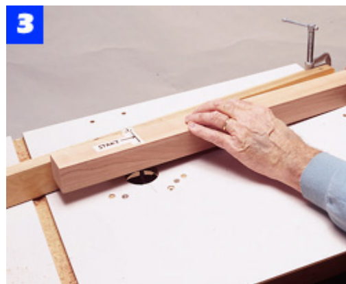
To begin a stopped groove at the blind end, lower the leg onto the bit. Then, slide the work toward the left.