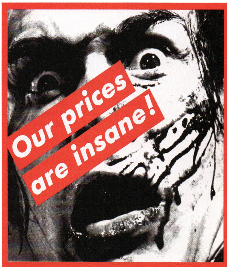
Untitled (Our Prices are Insane!), 1987